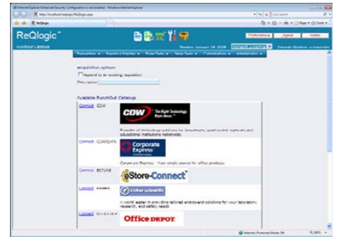
Figure 2: Punchout Catalogue Example

ReQlogic can be easily incorporated into your corporate-wide SharePoint implementation. Whether you're using Microsoft Dynamics Enterprise Portal, Business Portal, or a stand-alone SharePoint site, users have a single portal for their daily activities.