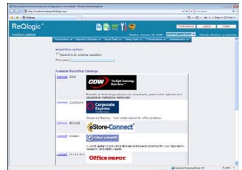
Figure 2: Punchout Catalogue Example

ReQlogic can be easily incorporated into your corporate-wide SharePoint implementation. Whether you're using Microsoft Dynamics Enterprise Portal, Business Portal, or a stand-alone SharePoint site, users have a single portal for their daily activities.