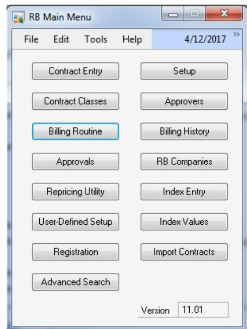
(RB Main Menu)